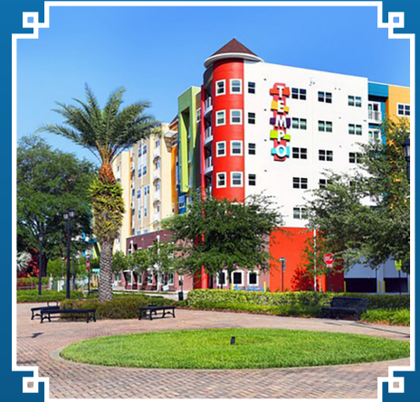
The Tempo at Encore, Tampa Housing Authority

Public Housing Agencies (PHAs) use the Rental Assistance Demonstration (RAD) Program to preserve affordable housing and improve properties by "converting" their form of federal assistance to the Section 8 program. PHAs choose to convert to either: Section 8 project-based voucher (PBV) or Section 8 project-based rental assistance (PBRA).