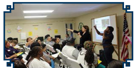
Residents should ask about any impacts converting to Section 8 may have on their rent, repairs that might be done on the property, and whether residents will need to be relocated temporarily.

PHA Plan. Note that in addition to meeting with residents of the converting project, a PHA must also amend its PHA Plan to reflect the proposed RAD conversion and solicit community input. As part of this process, a PHA will hold separate public meetings and collect comments.